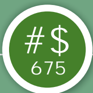
Bca raaˆ ˆ k[ojˆ;ˆaˆkˆ