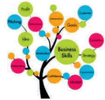
ˆ UgTSfjaˆ A bbadfgˆ [fk